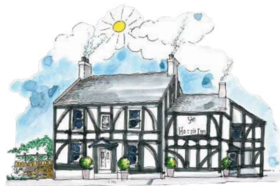
6. Ye Horns Inn On our doorstep! 1 mile | 15 minute walk Charming historic pub and restaurant serving fine food and local ales.