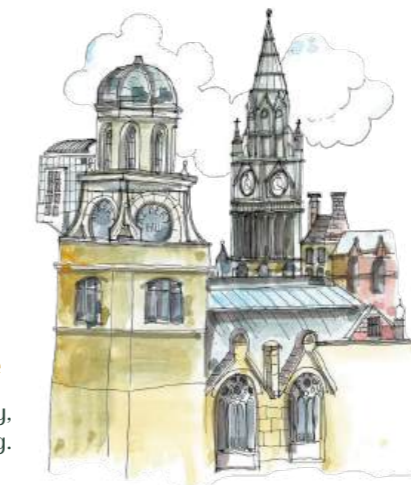
10. Manchester 20 miles | 30 minute drive A vibrant city of culture, history, and fabulous shopping and dining.