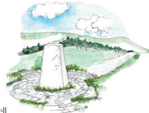
3. Beacon Fell 4 miles | 10 minute drive A Country Park with 185 acres of extensive conifer woods and moorland, offering spectacular views of the Forest of Bowland and Morecambe Bay.