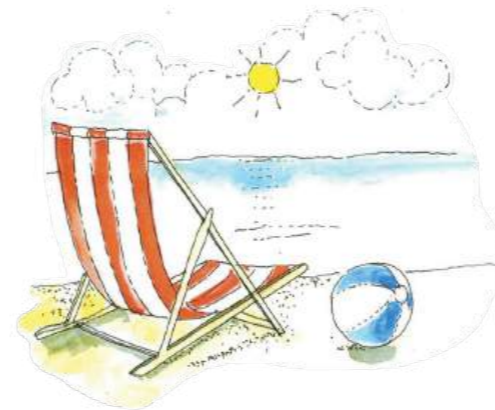
9. Lytham 20 miles | 30 minute drive A stylish seaside town with a scenic promenade and independent boutique shopping.