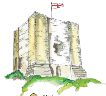
8. Clitheroe 14 miles | 28 minute drive A bustling market town, with a stunning 800 year old castle offering panoramic views of the Ribble Valley.