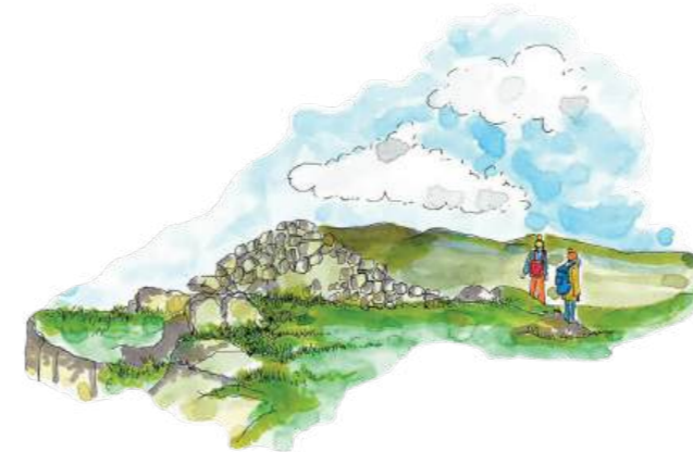
4. Parlick Fell 5 miles | 15 minute drive A rewarding climb with breathtaking views over the hills of the Forest of Bowland.