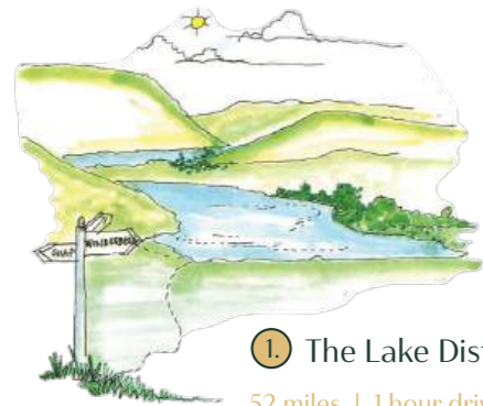
1. The Lake District 52 miles | 1 hour drive Stunning lakes, rugged fells, quaint cafés and endless opportunities for adventure.

We are incredibly lucky to be surrounded by a plethora of cultural attractions, beauty spots & more, right on our doorstep!