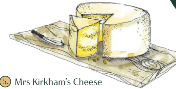
5. Mrs Kirkham's Cheese On our doorstep! 0.5 miles | 5 minute walk Award-winning Lancashire cheese and Farm Shop for a taste of Lancashire's finest delights!