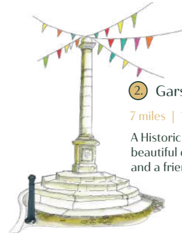
2. Garstang 7 miles | 16 minute drive A Historic market town with a beautiful canal, independent shops, and a friendly atmosphere.