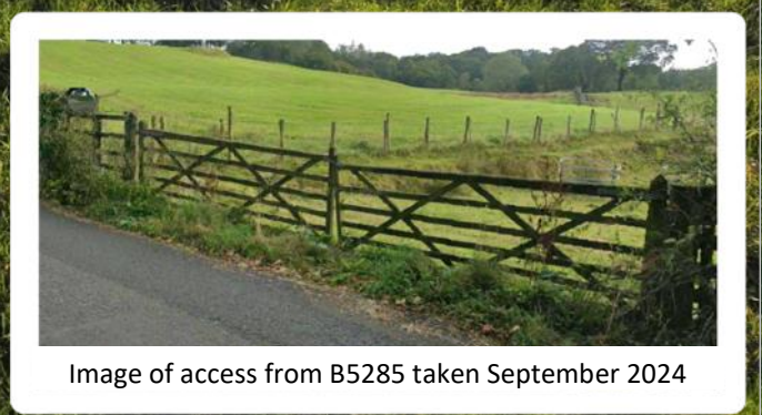
Image of access from B5285 taken September 2024